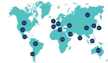
Table 2. G20 countries – public sector laws